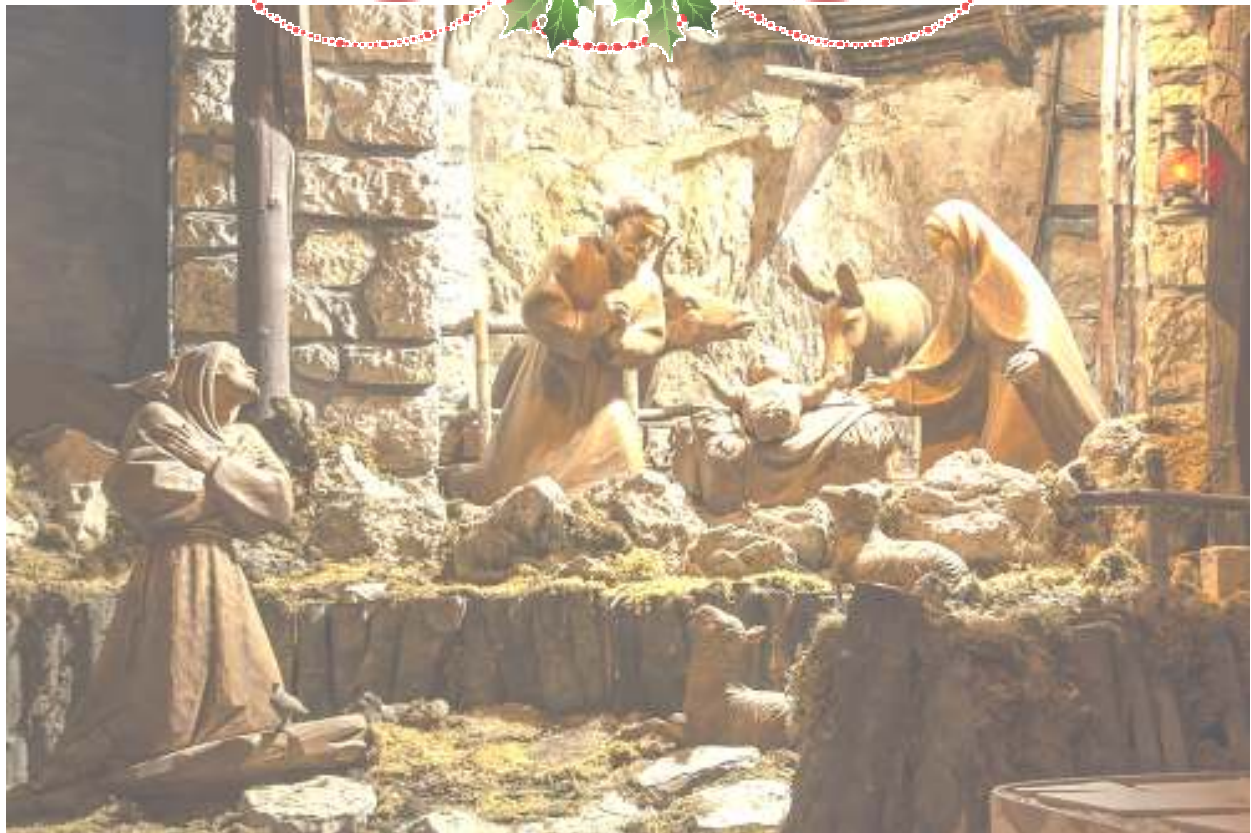
One of the many Christmas Crèche scenes at Santuario di Greccio in the Rieti Valley of Italy. It was on this site where St Francis of Assisi began the Christmas Crèche custom with his living crèche in 1223, as recorded by St. Bonaventure of Bagnoregio