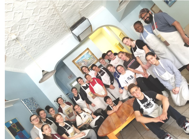
Bishop Allen Academy