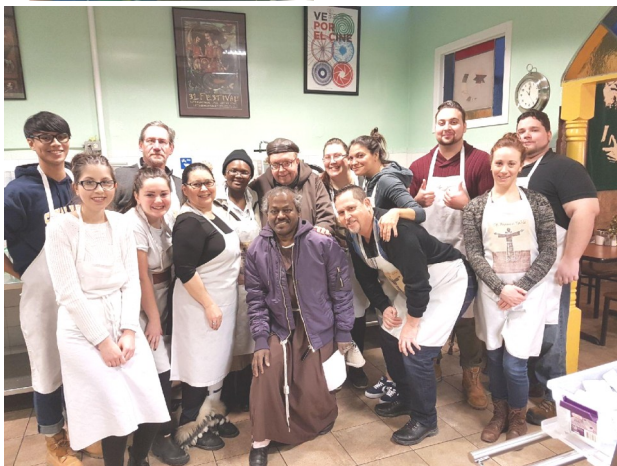
Transition to Communities volunteers