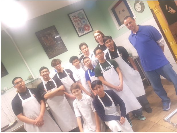
'Boyz of Brebeuf'