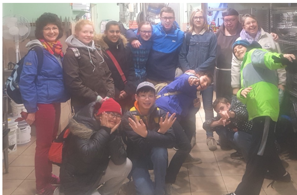
St. Michael Youth from Belleville, ON