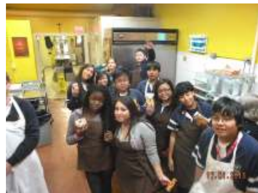
Student Volunteers from Ft. Bresani Catholic School Woodbridge, ON