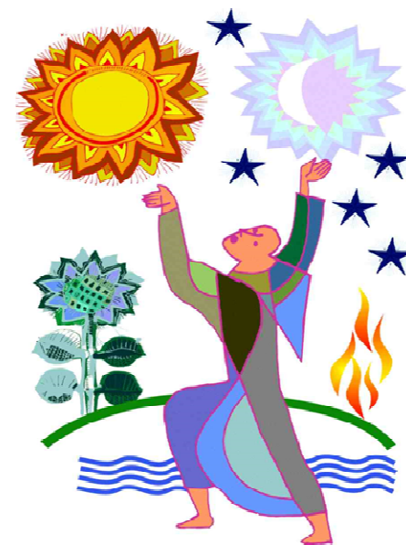
St Francis of Assisi Lover of All Creation

1322 Queen Street West Toronto, ON M6K 1L4