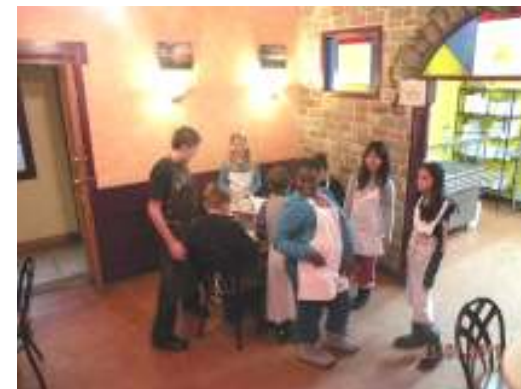
Student Volunteers from St. Marks Catholic School Toronto, ON