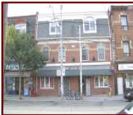
1322 Queen Street W., Toronto, ON M6K 1L4

Capuchin Outreach to the Poor (Parkdale) was founded in 1987 by the Capuchin Franciscan Friars of Central Canada with the vision of creating a faith community with the poor by providing direct services that seek to enhance the sense of human dignity of those who are in need.