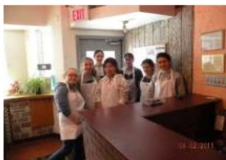
Volunteers from the Hawthorne School for Girls Toronto, ON