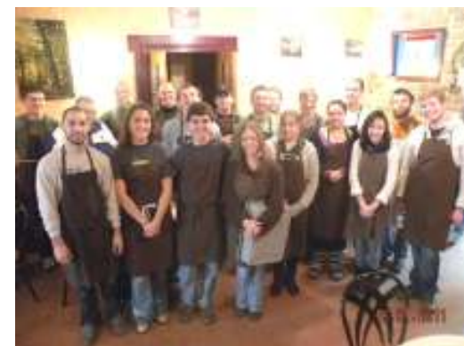
St. Vincent College Volunteers Pittsburgh, PA USA