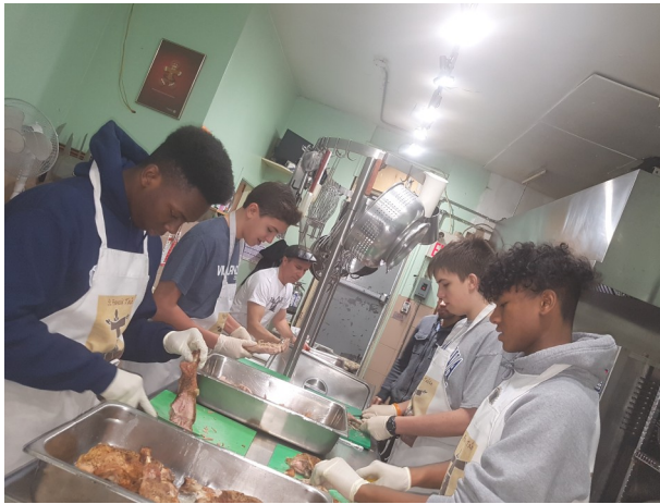
Villa Nova College, King City