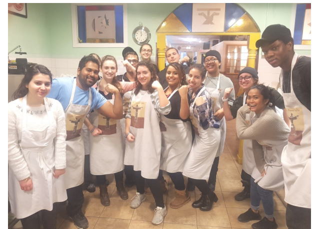
York U. Chaplaincy