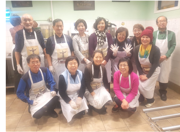
St John Vianney Secular Franciscans