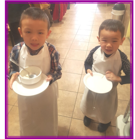
Our Youngest Table Bussers

1322 Queen Street West Toronto, ON M6K 1L4 Phone: 416.532.4172 Email: st.francistable@yahoo.ca