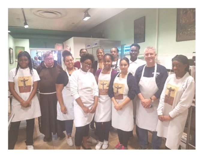
St. Marguerite D'Youville CHS Volunteers Brampton, ON