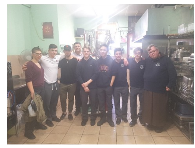
St. Br. Andre CHS Volunteers Markham, ON