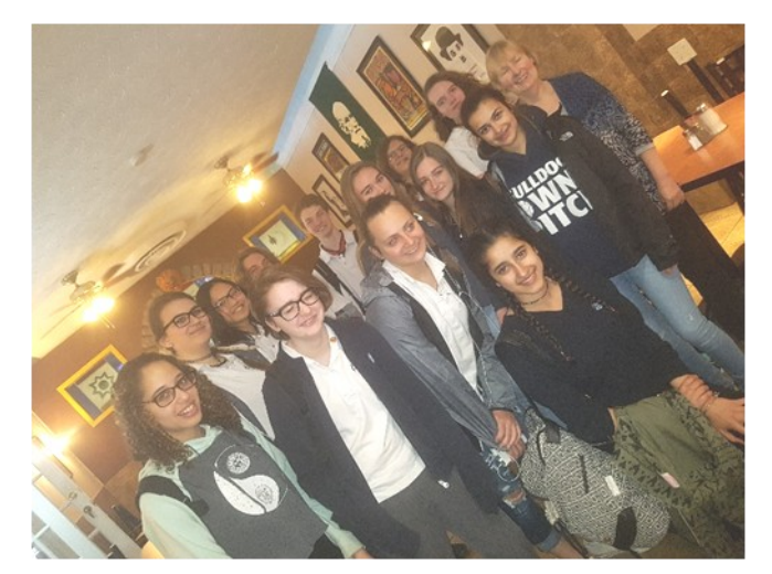
Our Lady of the Lake Volunteers Keswick, ON