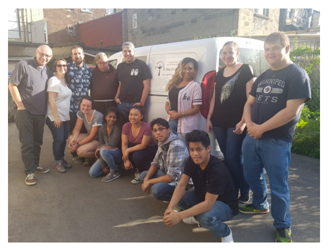
Youth Unlimited Volunteers Toronto, ON

year of presence and service to the poor in the Parkdale neighbourhood! Dec 25, 1987—Dec 25, 2017