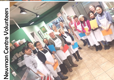
Newman Centre Volunteers