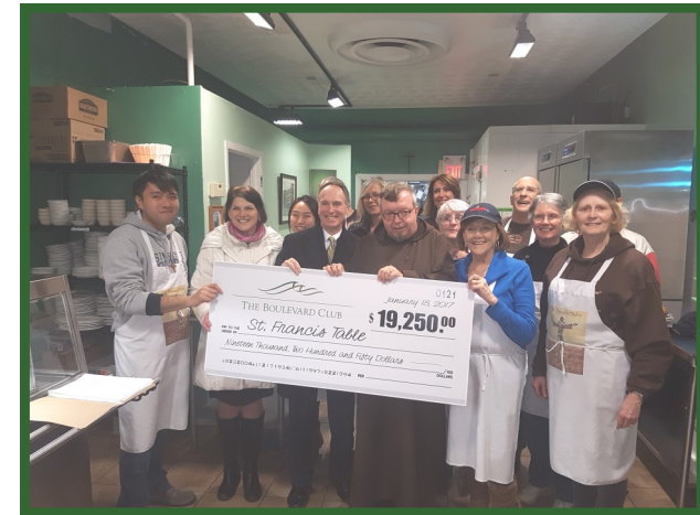
A Presentation from the Boulevard Club

1322 Queen Street West Toronto, ON M6K 1L4