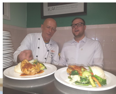
Chefs from Allstream Centre