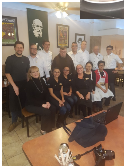
Staff from Allstream Centre