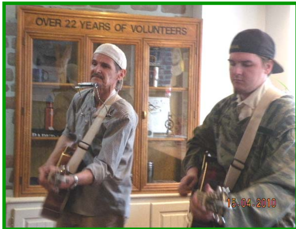
J & G DUO PERFORM FOR OUR PATRONS