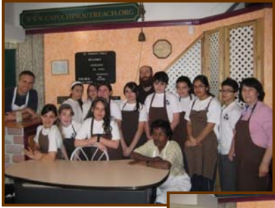
LEONARDO DE VINCI ACADEMY VOLUNTEERS (TORONTO)