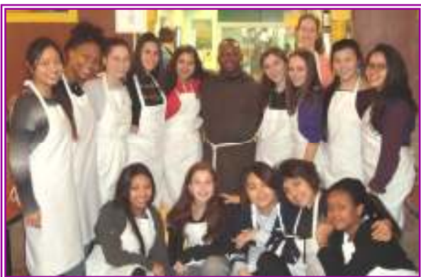
Volunteers from Loretto Abbey in Toronto