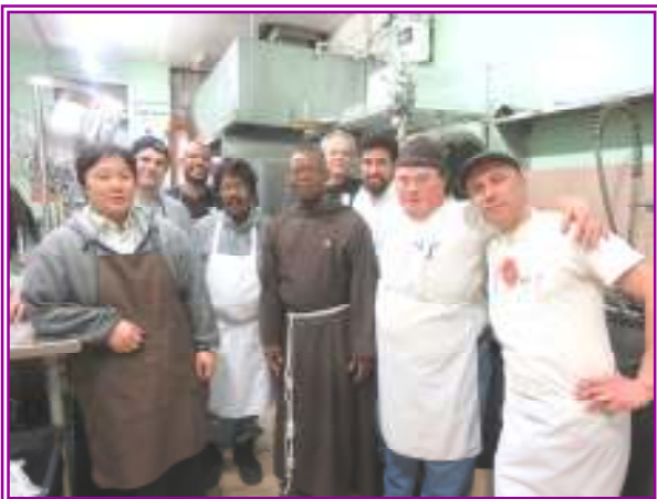
Fraternity and Community is the spirit of St. Francis Table