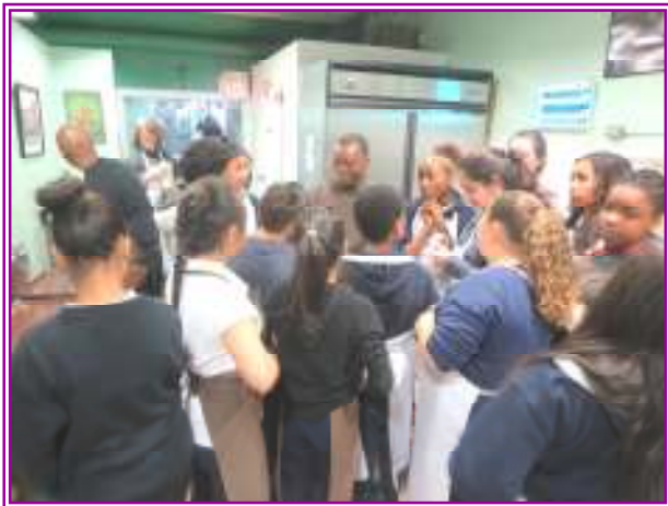
Distributing St. Francis pins to students from St. Thomas Aquinas Elementary School