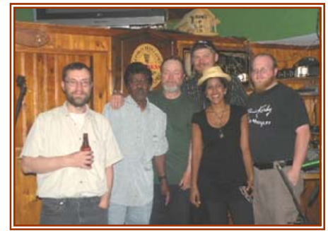
With 'Shamrock' an Irish-Newfoundland Band.