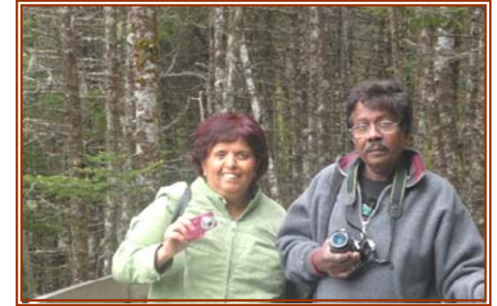
On the trail at Salmonier Nature Park

Fond memories of Summer 2010 with Youthworks and Center for Student Ministry Volunteers from throughout North America...Thanks and God-Bless you all!!! ↓