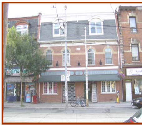
1322 Queen Street W., Toronto, ON M6K 1L4

Capuchin Outreach to the Poor (Parkdale) was founded in 1987 by the Capuchin Franciscan Friars of Central Canada with the vision of creating a faith community with the poor by providing direct services that seek to enhance the sense of human dignity of those who are in need.