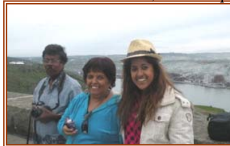
On Signal Hill