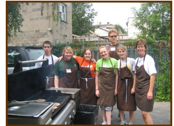
SUMMER VOLUNTEERS FROM THE UNITED STATES