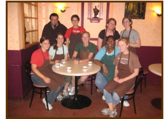
FOCUS GROUP VOLUNTEERS FROM THE UNITED STATES