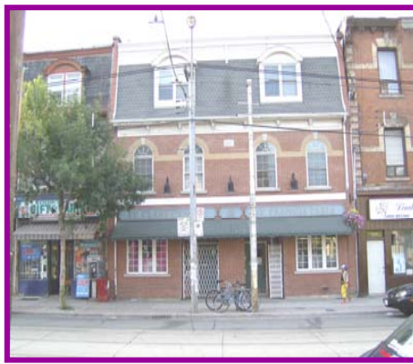
1322 Queen Street W., Toronto, ON M6K 1L4

Capuchin Outreach to the Poor (Parkdale) was founded in 1987 by the Capuchin Franciscan Friars of Central Canada with the vision of creating a faith community with the poor by providing direct services that seek to enhance the sense of human dignity of those who are in need.