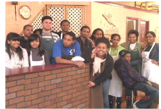
St. Nicholas of Bari Volunteers