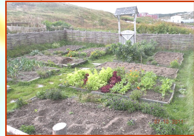
A FALL GARDEN AT THE 17TH CENTURY COLONY OF AVALON (FERRYLAND, NL)

1322 Queen Street West Toronto, ON M6K 1L4