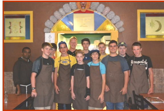
Volunteers from Toronto District Christian High School (September 5, 2013)