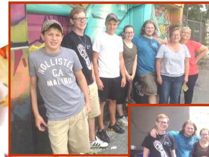
Tavistock Team from TOOLS