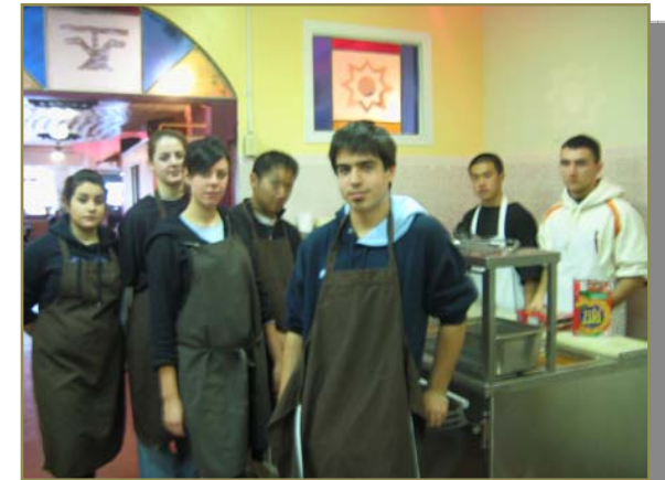
ST. BASIL THE GREAT CATHOLIC SECONDARY SCHOOL VOLUNTEERS