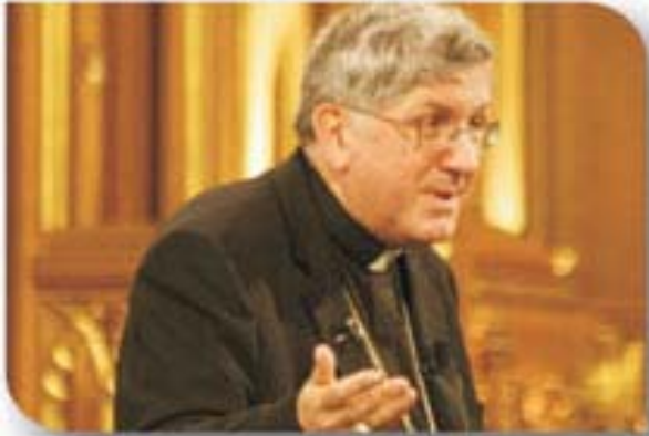
ARCHBISHOP THOMAS COLLINS